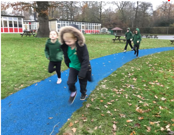
Fir Class showing us how it's done!

As of the end of Thursday, we have managed a whopping 505.65 miles/3,371 laps of the daily mile track and we have raised £315! Please keep your donations coming and send the link to family and friends in the local area. Your sponsorship means so much to the children.